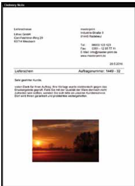
Convenient print of delivery note