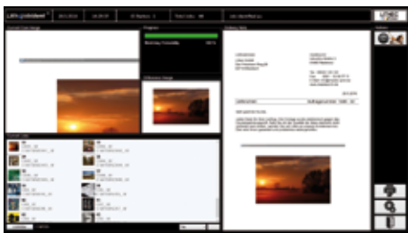
Prepared job time ticket for print